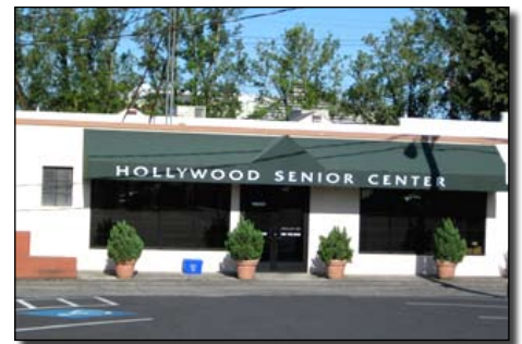
The Hollywood Senior Center seen from the back entrance.

23-24 August - Shakespeare-in-the-Parks Performing "The Two Gentlemen of Verona" @ Fernhill Park [3pm] Free