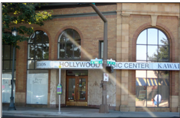
Hollywood Music Center's corner location with its iconic architecture is closed up.

It must have been tough to sell pianos in this economy.