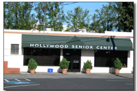
The Hollywood Senior Center seen from the back entrance.