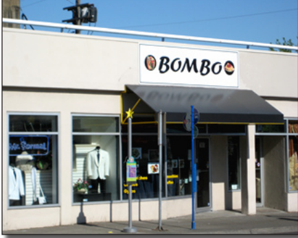
Bombo is open and serving food & drinks.

This small cafe is open in the previous Freedom Cup location across from the Hollywood Burger Bar on NE 42nd x Sandy. Pick up some snack food, like gyros and pastries, or a coffee or smoothie.